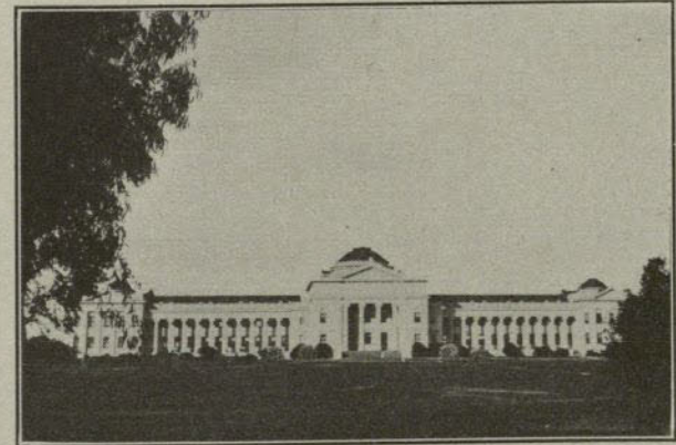
The Open Door to the Teaching Service.