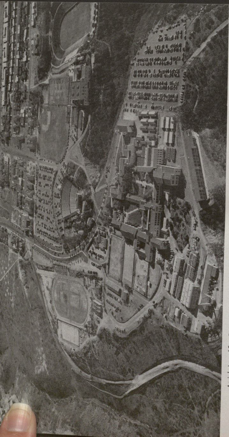
Aerial view of San Diego State College Campus. Six additional buildings have been authorized or are under construction.