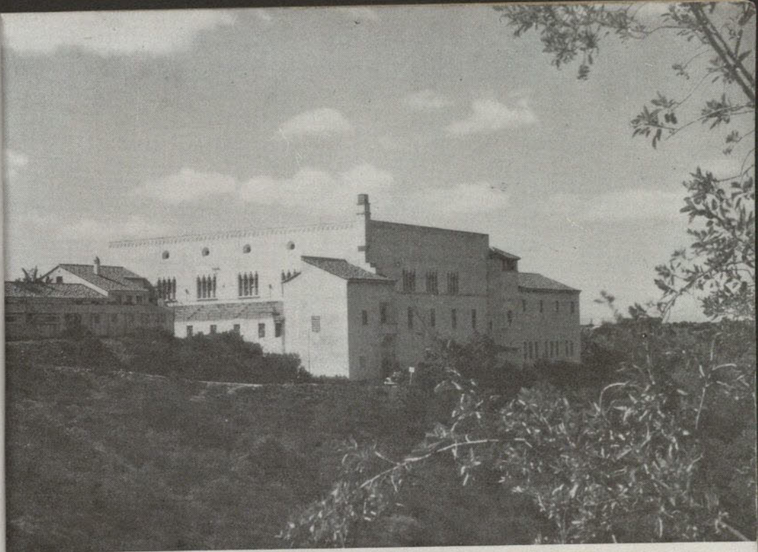
▲ ACTEC Gymnasium