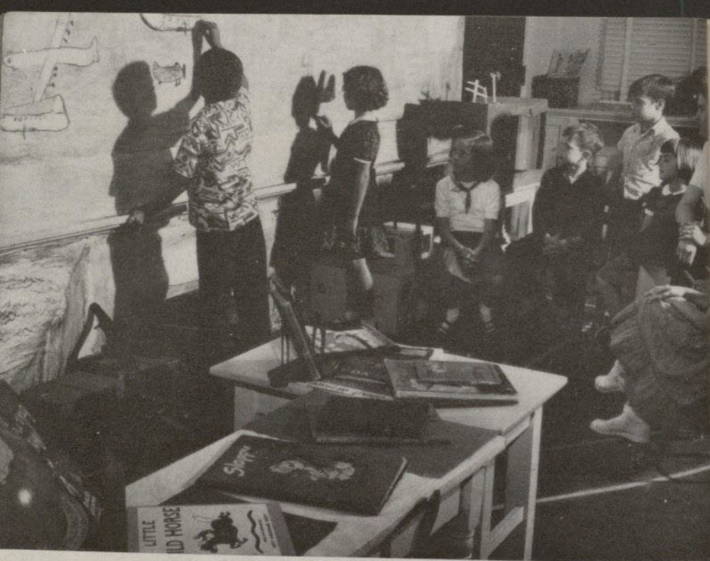
▲ Campus Elementary School